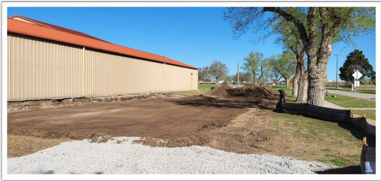
Future home of the Artillery OCS Heritage Hall 40'x 80' addition and 40' x 50' courtyard attached to the South Gallery of the US Field Artillery Museum at Fort Sill. (March 2023)