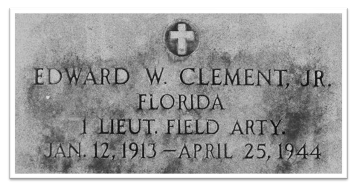
Buried in Hillcrest Cemetery, Ocala, Florida