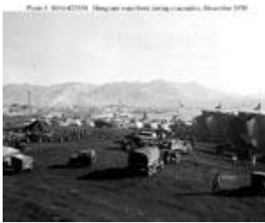
Hungnam during December 1950 evacuation