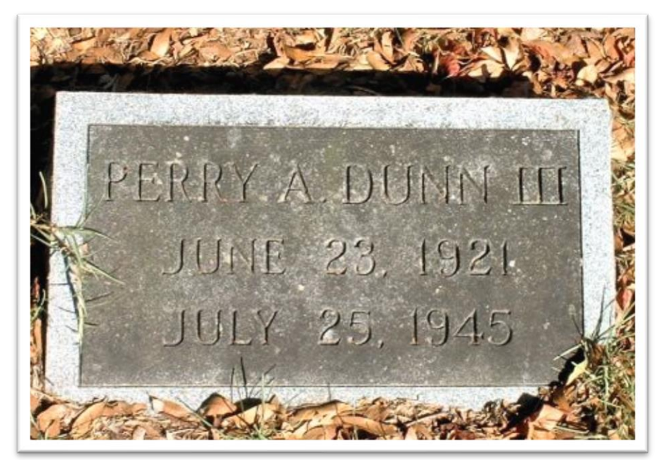
Buried in Oak Hill Cemetery, Prattville, Alabama