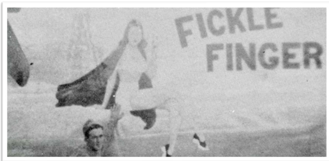
Starboard (right) side nose art