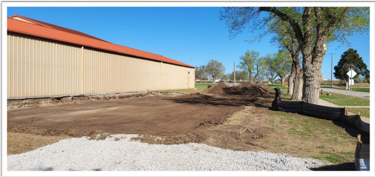
Future home of the Artillery OCS Heritage Hall 40'x 80' addition and 40' x 50' courtyard attached to the South Gallery of the US Field Artillery Museum at Fort Sill. (March 2023)