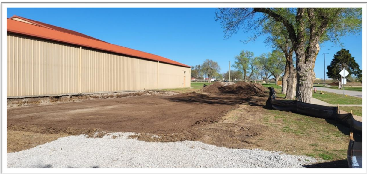
Future home of the Artillery OCS Heritage Hall 40'x 80' addition and 40' x 50' courtyard attached to the South Gallery of the US Field Artillery Museum at Fort Sill. (March 2023)