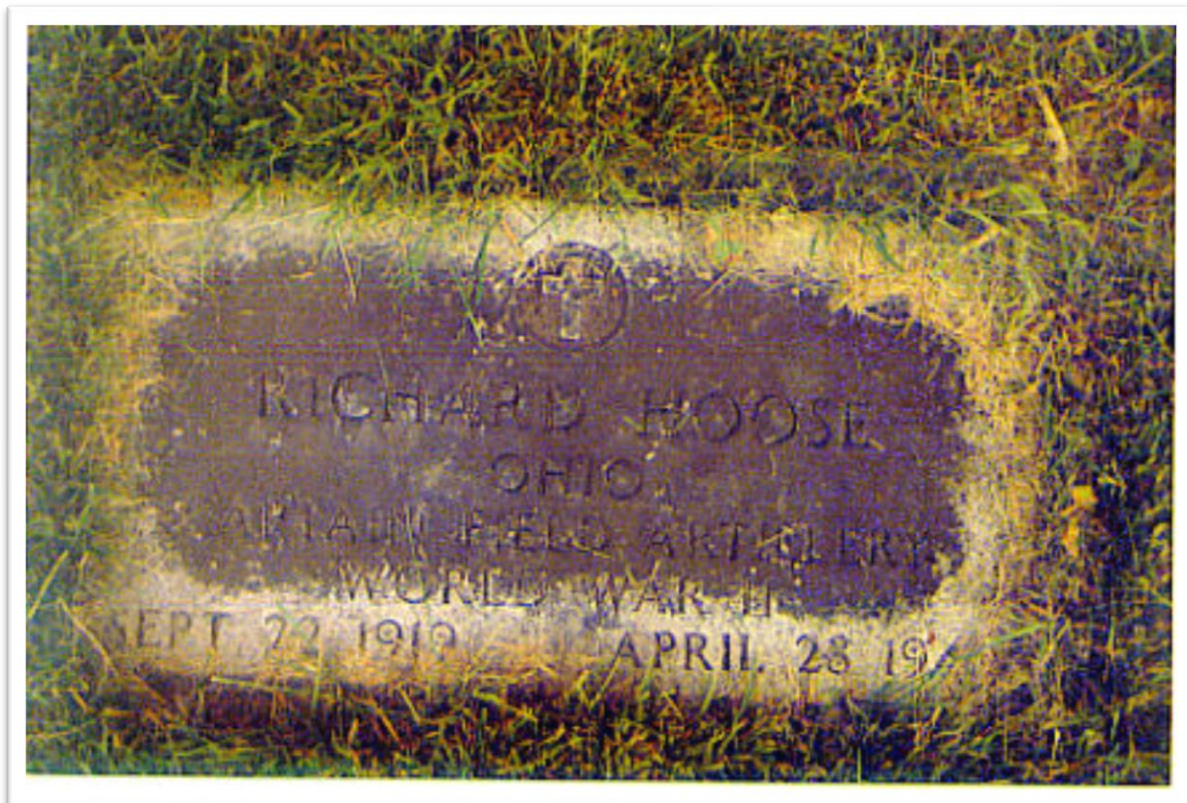
Buried in Rose Hill Burial Park, Akron, Ohio