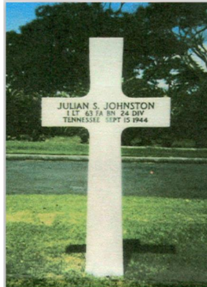
American Memorial Cemetery Manila, Phillipines