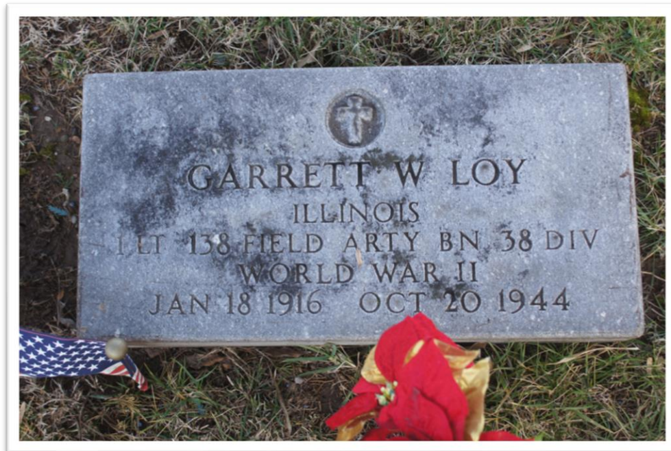
Buried in Oakridge Cemetery, Effingham, Illinois