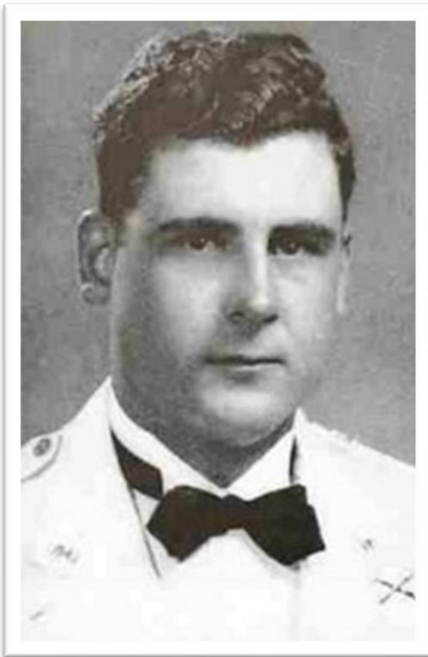
FA OCS 1943