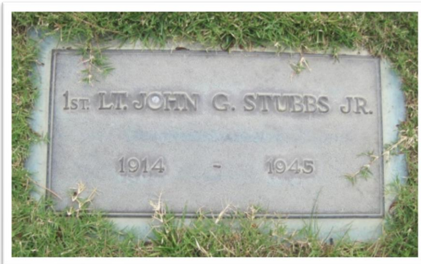
Buried in Forest Lawn Memorial Park, Glendale, California