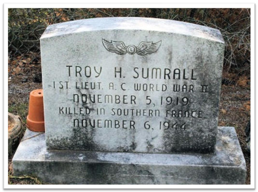
Buried in Fairview Cemetery, Sumrall, Mississippi