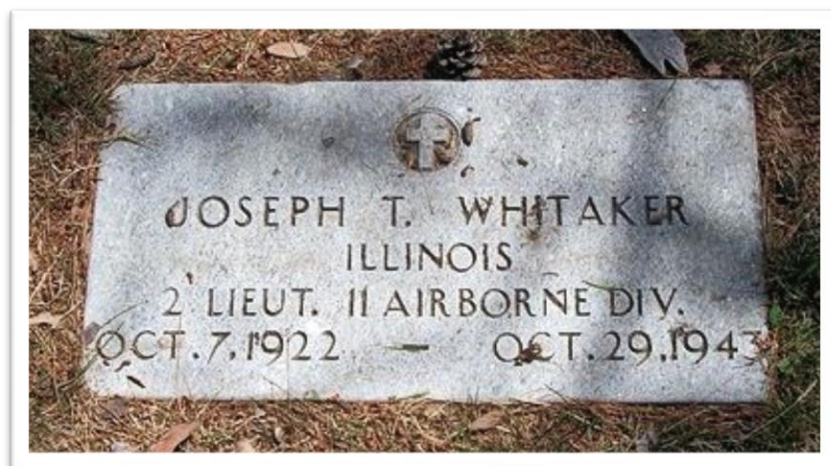
Buried in Pine Grove Cemetery, Wasau, Wisconsin