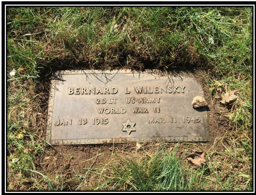
Buried in Sharon Memorial Park, Sharon, Massachusetts